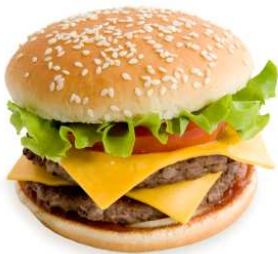
A Big Mac